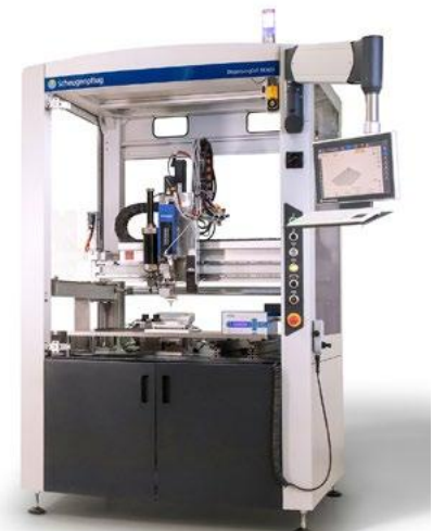
Figure 3 > Dispensing and curing combined in one system