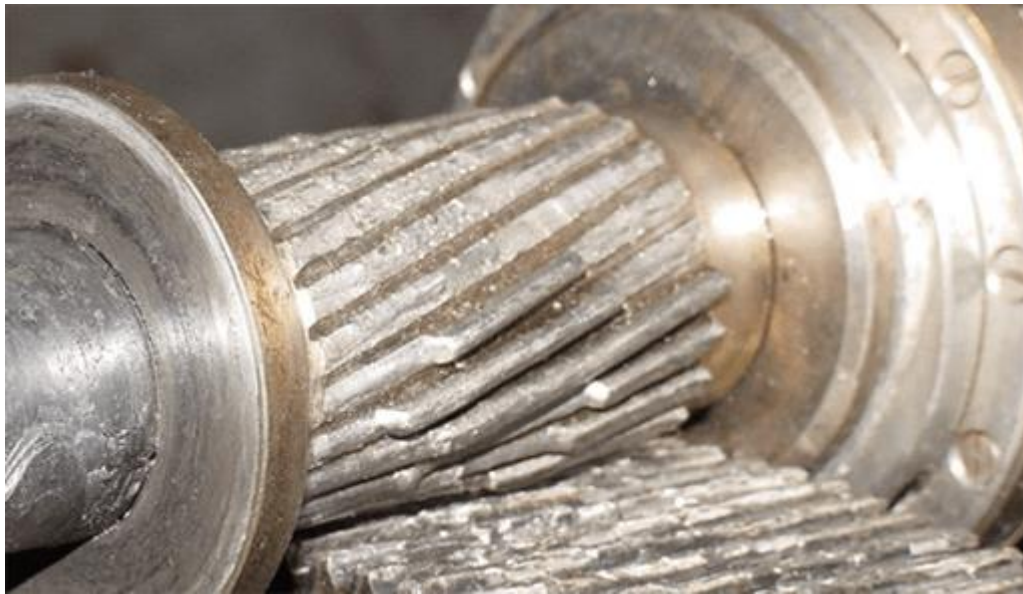
Figure 2: A damaged centrifugal compressor caused by surge

* The device strongly vibrates, and at the same time it emits abnormal airflow noise.