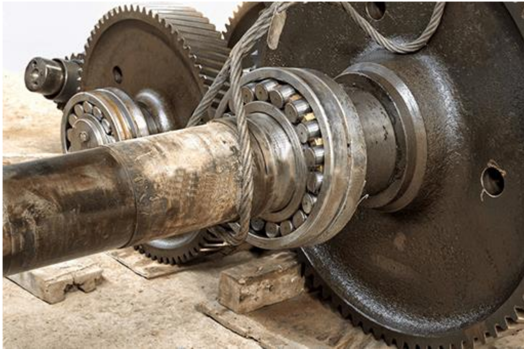
Figure 1: A close-range photograph of centrifugal compressor bearing.

* If the bearing shell is damaged, it should be recast.